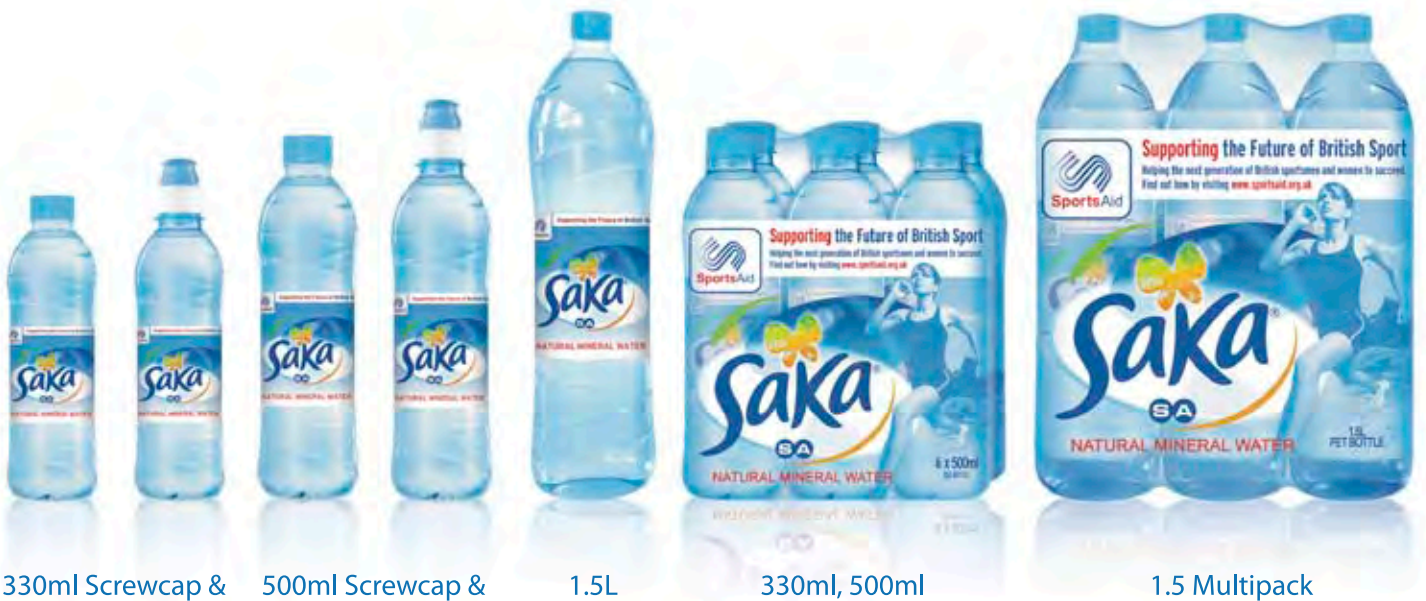
330ml Screwcap & Sportscap